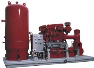
Fire Pumps, Packages and Engineered Systems