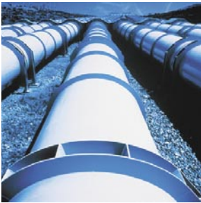
Municipal & Building Trades