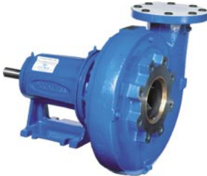
End Suction Pumps