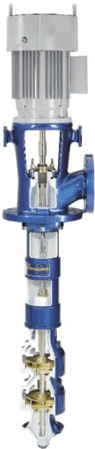
Vertical Turbine Pumps