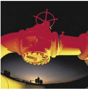
Industrial, Process, Pulp & Paper