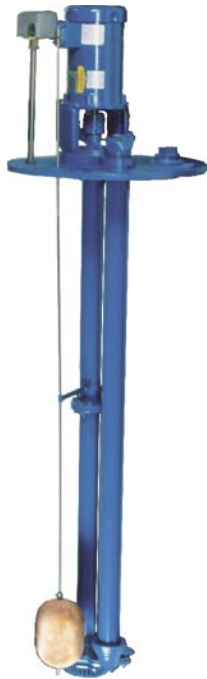
Sump & Sewage Pumps