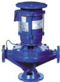
In-Line Centrifugal Pumps