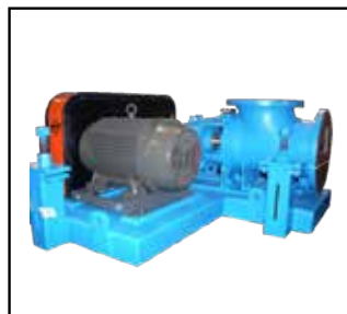
Custom Axial Flow Bases w/ Motor Adjusters