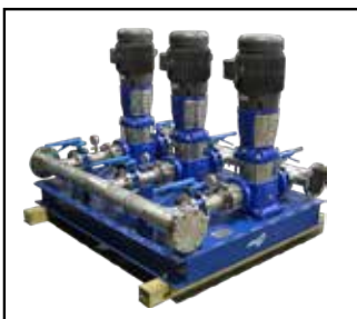
SS TriPlex Booster System