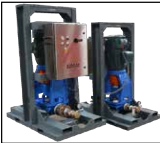
Custom 3996 Hanging Bases