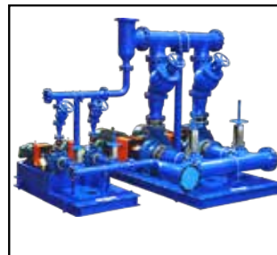
Tandem Package Skids