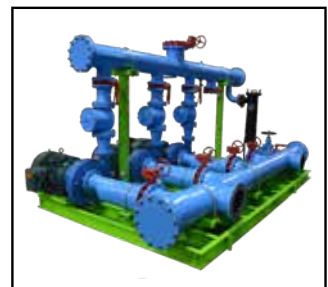
TriPlex Filtration Skid