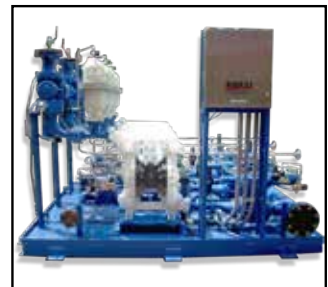
AODD Multi Pump Package