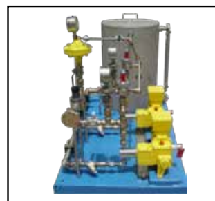
Metering Pump Skid