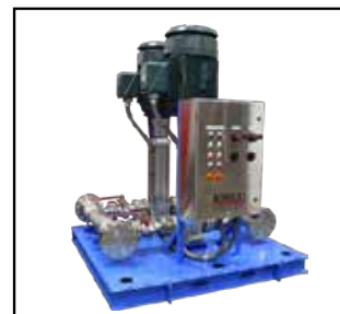
Duplex Booster Package w/Controls