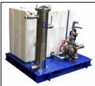
AOD Filter Tank System