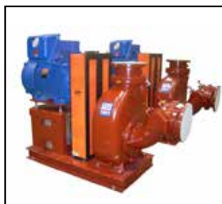
Self-Priming Fire Pump w/Bases