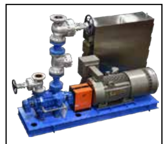
High Pressure Multi Stage Control Package