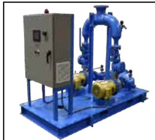
Apex Duplex w/Controls